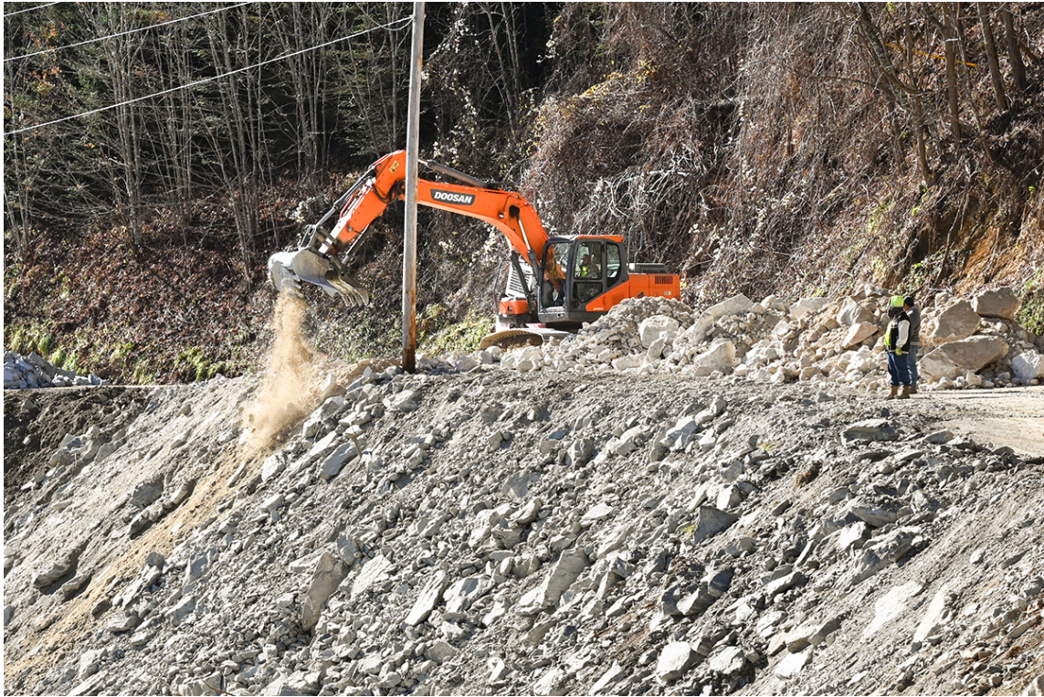
A road repair operation in Avery County, North Carolina, in the aftermath of Hurricane Helene.

The OSDIA/SIF Hurricane Relief Fund, which collected funds from October through December of 2024, raised more than $7,000 to support relief efforts following the devastating impacts of hurricanes Helene and Milton last fall.