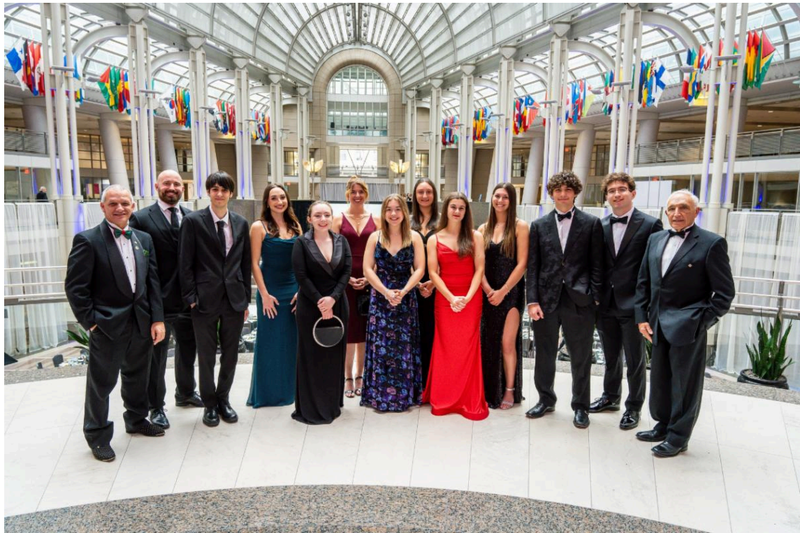
SIF Scholarship recipients pose for a photo at the 35th National Education and Leadership Awards (NELA) Gala in Washington, D.C. (May 23, 2024).

Applications for the Sons of Italy Foundation's (SIF) National Leadership Grants are open for 2025!