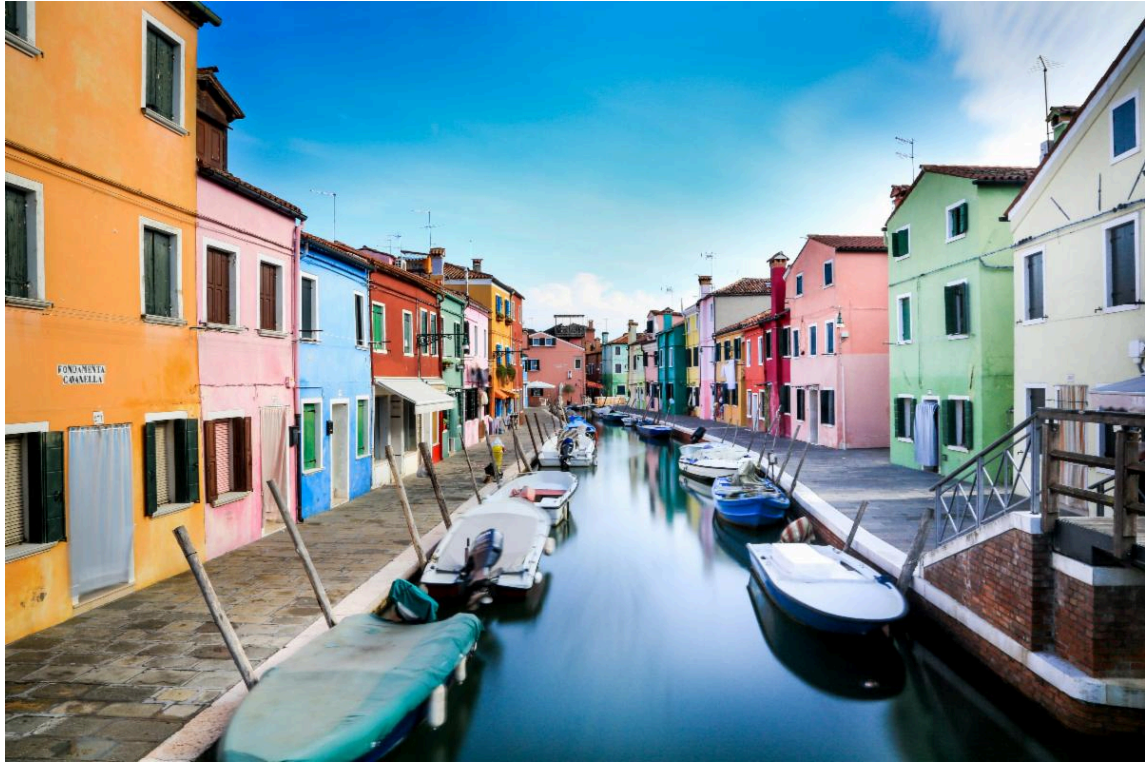
Colorful homes line a canal in Venice, Italy.

Are you interested in buying a home in Italy, or do you want to learn more about the Italian real estate process? Mark your calendars for Wednesday, February 5th at 11:00AM EST for a webinar on the differences between real estate in Italy and the U.S.